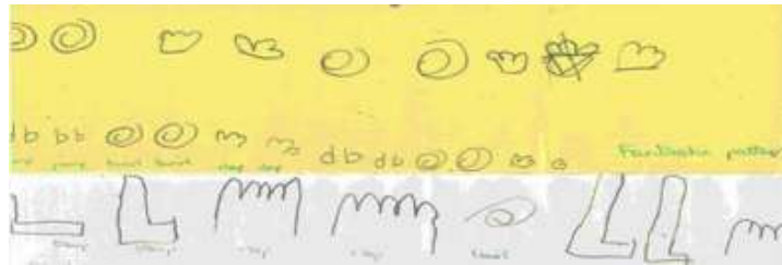
jumps, twirls, claps and stamps